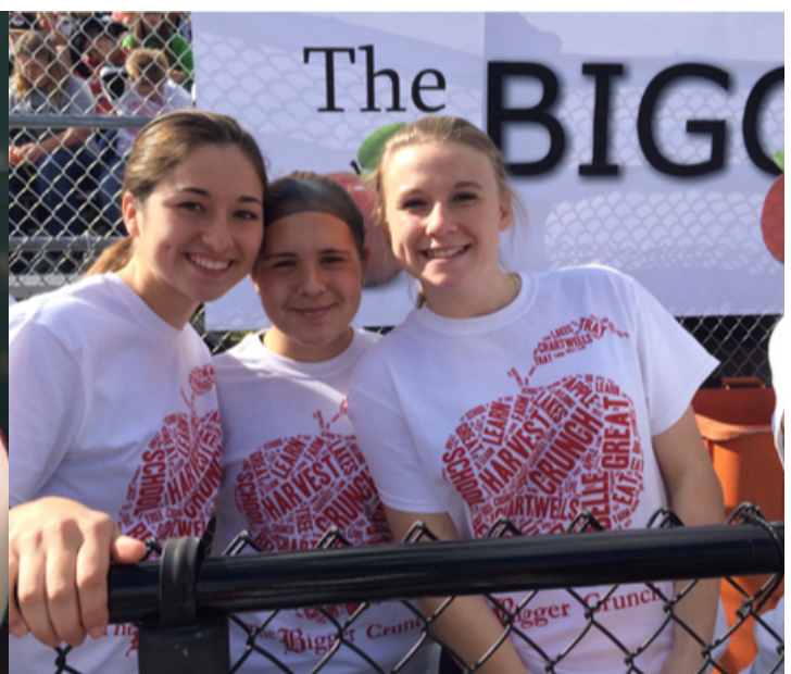
Belding Area Schools gets ready to Crunch