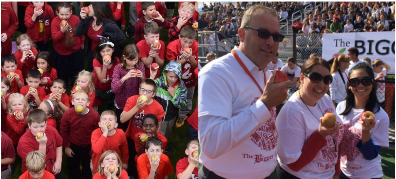
Wear your favorite apple color!

Please note: This PDF includes clickable links to additional online resources. Clickable links are blue and followed by a blue arrow (↗).