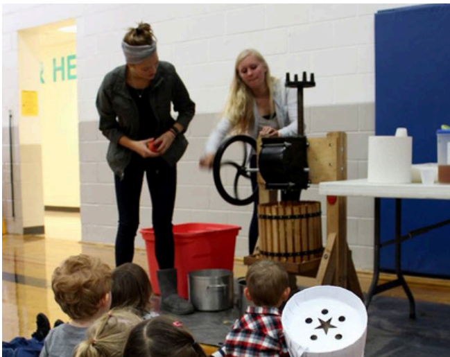
Make apple cider with students!